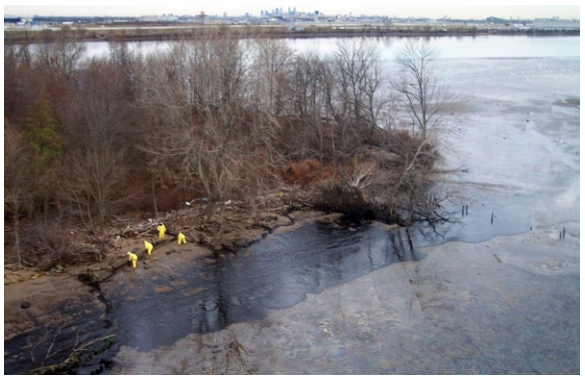
Athos I oil spill in Delaware River